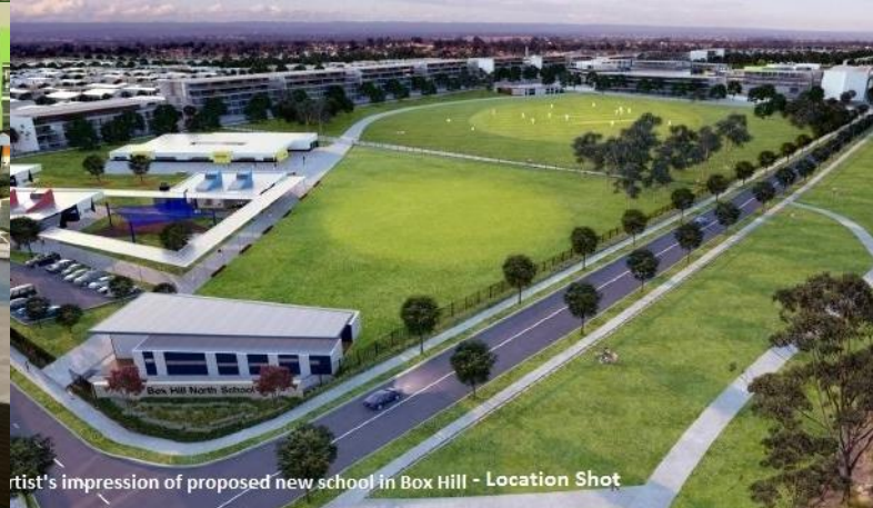
Artist's impression of proposed new school in Box Hill - Location Shot